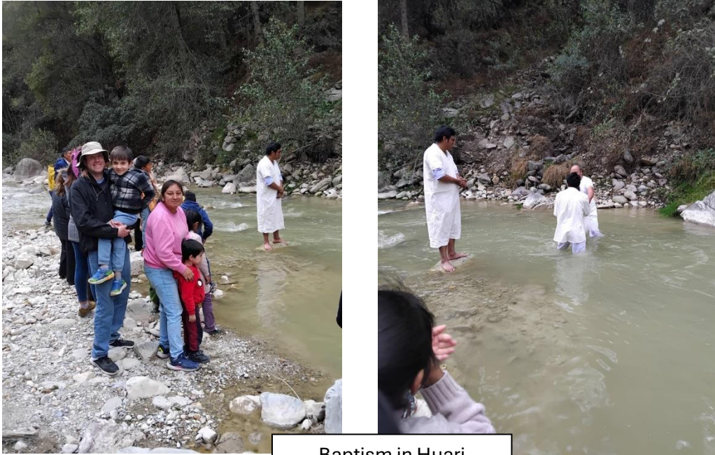
Baptism in Huari

We also continue forming relationships at the Huari church (about 30 minutes from Huancayo). We were privileged to go and witness a baptism of three ladies in a river in Cochas, along with the Huari church. We hope and pray the Lord shows us his grace in working with his church more to reach the community there.