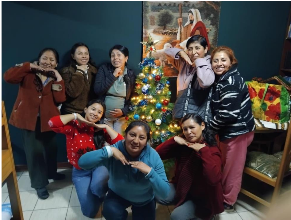
The ladies' small group Christmas party

The women's Bible study small group is almost done with Proverbs and has gone through the whole book! They had a Christmas party this month and prayed and declared truths over their families, husbands, and kids through prayer. It was a great time!